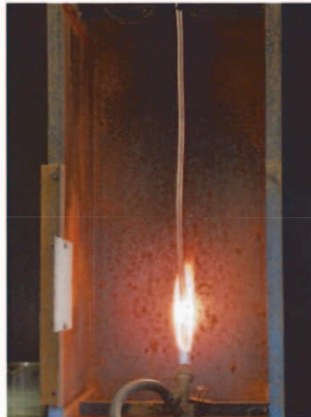
Course of the tests