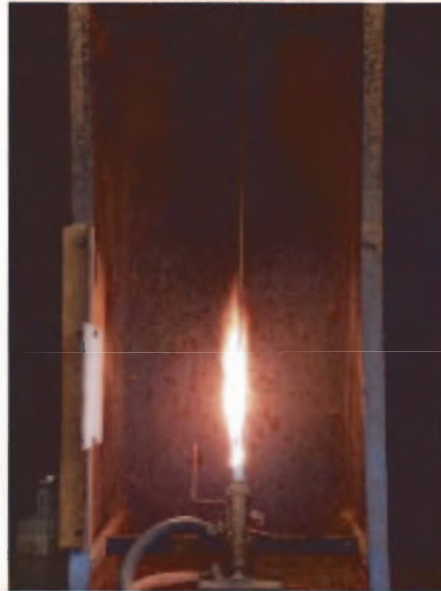
Course of the tests