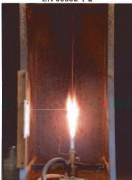
Course of the tests