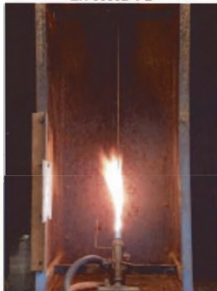
Course of the tests